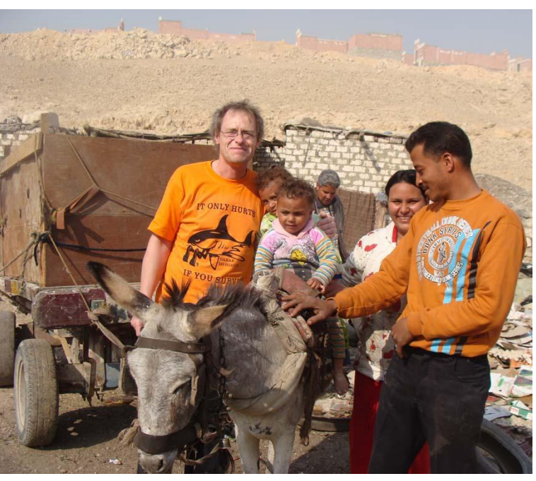
A donkey for a family, who just settled down in this area before some days