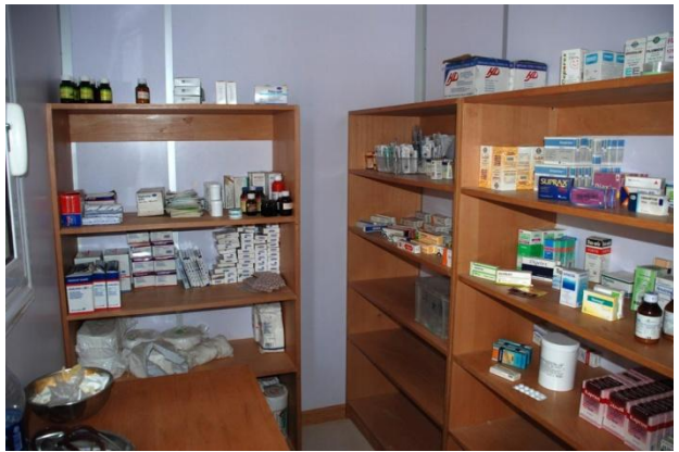
Inside the clinic

Our last and biggest project - finished April 2013 - was a first-aid container, that we could produce in western standard, and which is today the only medical center is in the whole garbage area, where people receive help in case of illness. A nurse is available around the clock. Doctors are coming as needed.