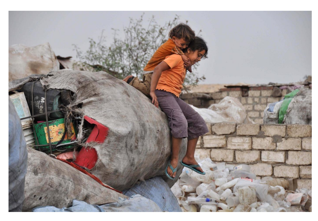
In the moment the children are paying just in the garbage and use the bags as a slide

190 000 €, our association could provide in those 10 years for aids to fund all, what is described here. Not less than € 7,000 we need for current, non-discretionary expenditures. We are only a small association, with a lot of very dedicated volunteers! So we are happy about everyone who is helping us by praying, by donations or by working with us in the garbage areas of Cairo! These kids are worth to invest ourselves - we will give them a future!