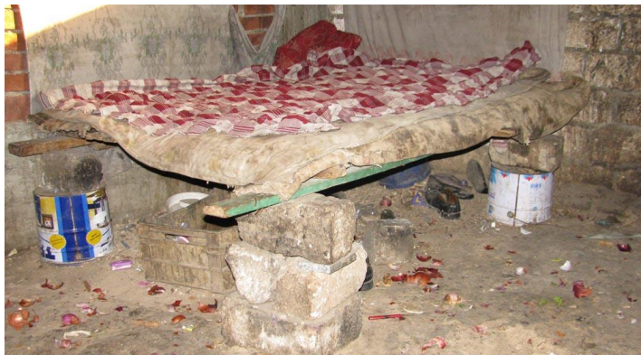
Bed in the garbage area of 15. of Mai

work animals for families who could not afford the price. In some cases, we even paid the building of a "house", when the breadwinner failed and the family would have to live in unacceptable conditions.