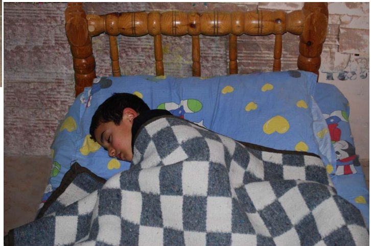
We could change it...

In addition we finance operations and buy prostheses for destitute residents. Beds, blankets, clothes, goats, and if necessary also foods we provide for the most needy people. The association bought donkeys as