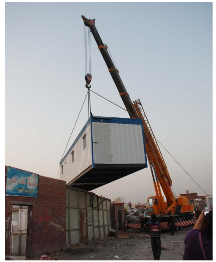
The crane brought the Container on its place in April 2013