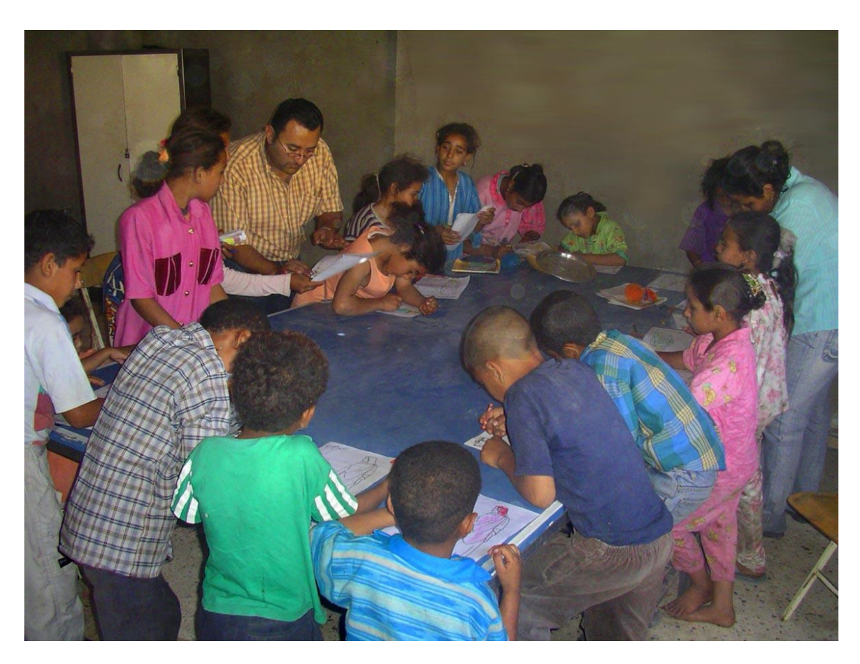
Private lessons in the new education room

For recreation we finance for the children of the garbage area each year a Christian Conference in Alexandria for one week, also we arrange trips in the area, with a great