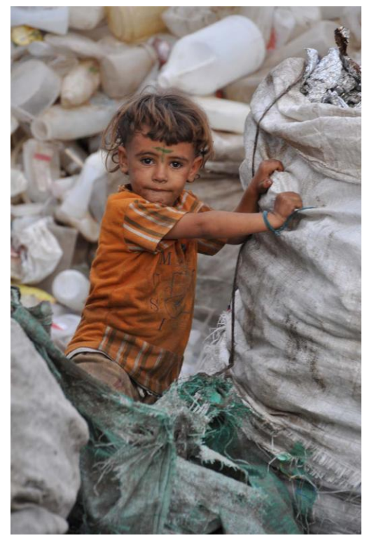
Christian kid playing in the garbage

Cairo called: "15 May", it is named after the satellite town beside. The construction of a youth- and education center was co-financed and we take over the complete payment for the teachers coming to this place to give the children lessons in English, Math and Arabic, to open them better conditions for their future.