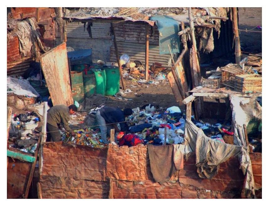
Some houses in "15. of May", with garbage workers